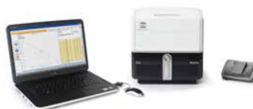
Figure 1: Eco Real-Time PCR System

Key components of the high-performance Eco Real-Time PCR system include the Eco instrument, a notebook with Eco software pre-installed, and the Eco sample loading dock.