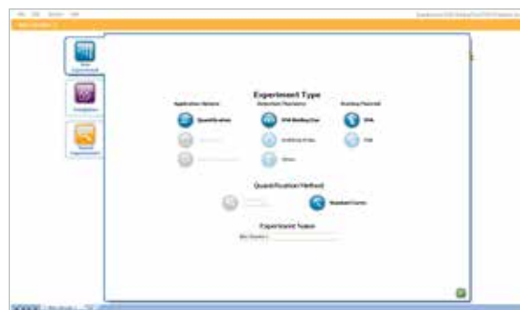
Figure 3: Icon-Based Interface Easily Directs Users From Setup to Analysis

Intuitive icons on each screen enable researchers to easily walk through setup, run, and analysis for their Real-Time PCR experiment.