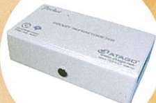
Convenient storage case

When intense light penetrates the prism of a digital refractometer, the light waves interfere with the sensor resulting in inaccurate readings. The PAL series is equipped with ELI technology, which will display the warning message "nnn" if the ambient light is too intense. If the warning message is displayed, simply turn away from the light source or shade the prism with your hand and press the START key again.